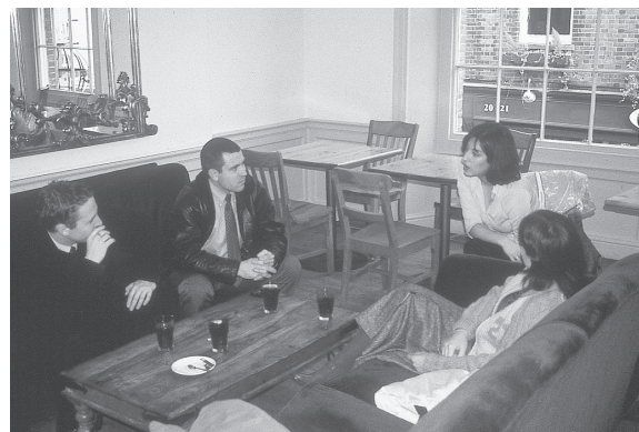
The Slug and Lettuce